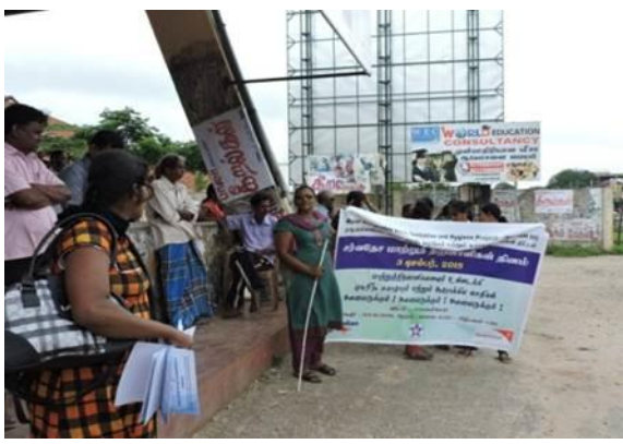
DPO members in District project steering committees