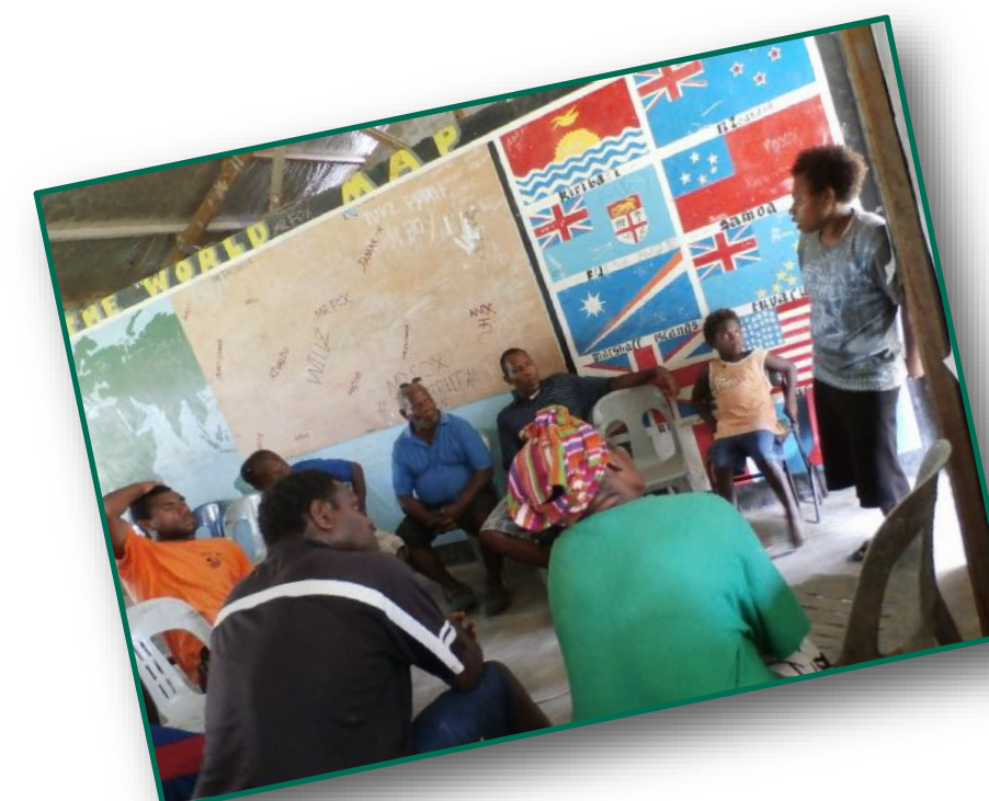
Community discussion in Erakor Half Road

Business plans and initiation of the first Community-based Sanitation Enterprises have been drafted.