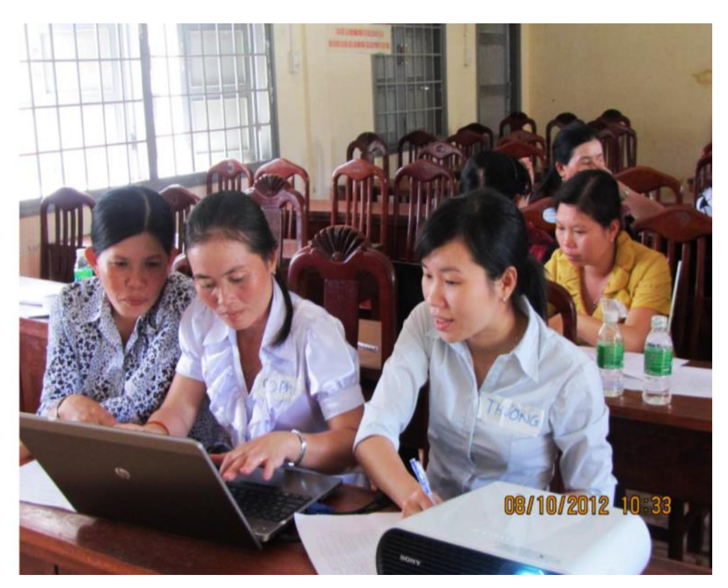
Women's Union members from the Mekong Delta work with their provincial latrine database

Delivery costs far lower than other approaches while leveraging massive local investment