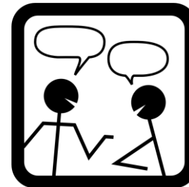
Face-to-face @ EARLE