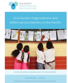
Capture and share