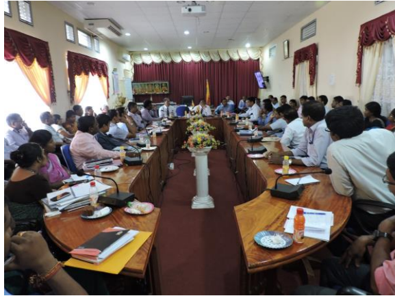
DPO members in District project steering committees