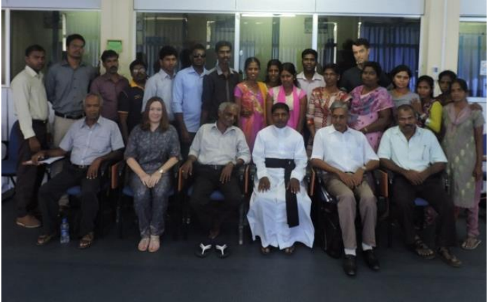
Photo: Training participants on CRPD