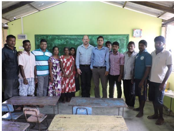
DPO members in WASH CBO committee