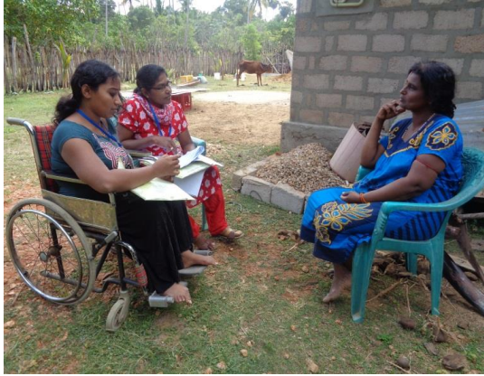
DPO members collecting data