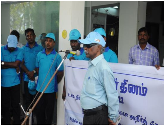
NPCODA involved in World Water Day awareness raising.