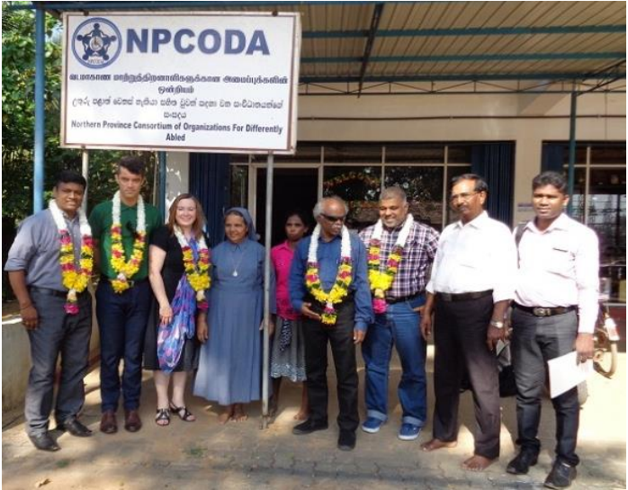
NPCODA, World Vision and CBM