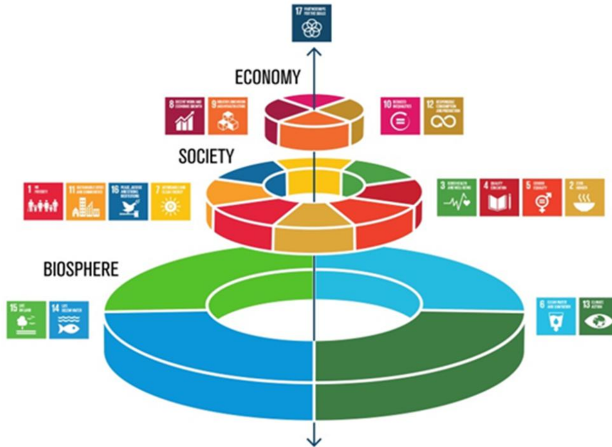
Links between Sustainable Development Goals (Stockholm Resilience Centre)