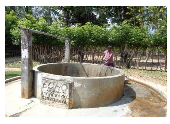
Fetching from Common well