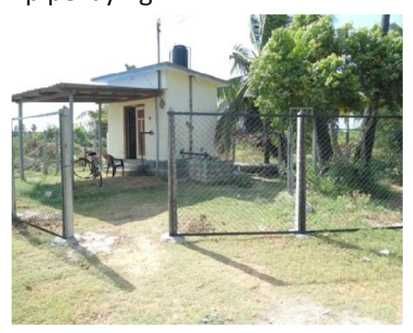
Water source protection