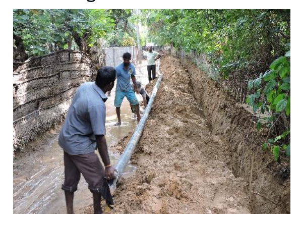
WASH CBO monitor the pipe laying work