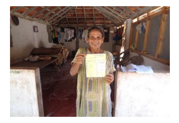
A beneficiary with bill as Samurdhi beneficiary