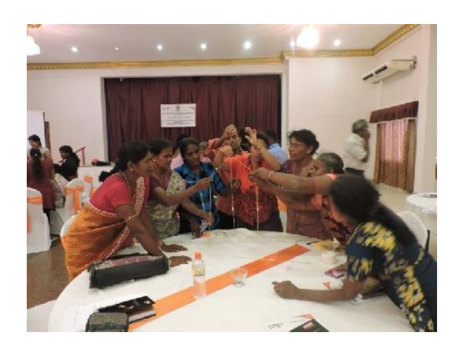
Capacity building training