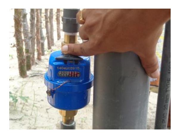
Meter reading for tariffs