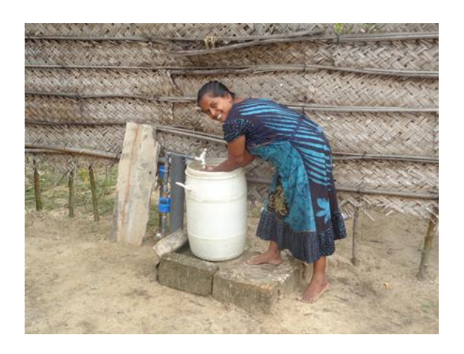
House hold receives safe water